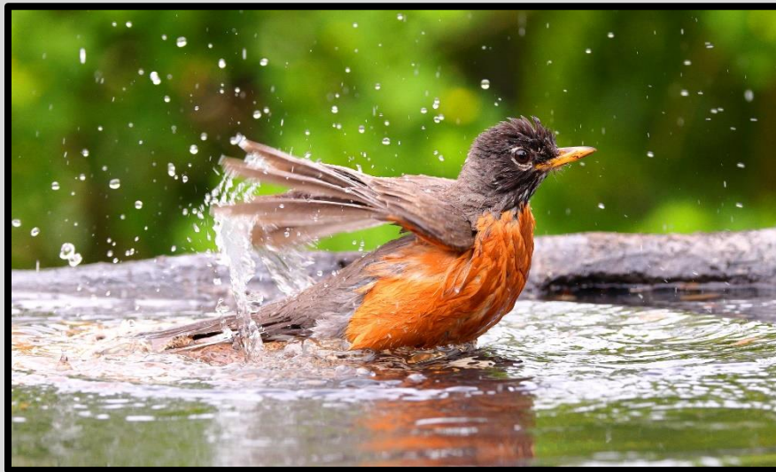
Figure 1 American robins relish a dip in the reflection pool. This is a pool of water seven feet long by 3.5 feet wide and 2 inches deep. It is made by using sawhorses, heavy boards, a wooden pool frame, and a pond liner to hold the water. The pond liner is hidden with natural objects. We teach you how to easily and inexpensively do this.

We love being at our mountain home and know you would thoroughly enjoy it too. Our home is adjacent to the lodgepole pine forest on a mountain slope at 6600 feet. Our ten acres border the national forest that begins right behind our garage and that makes it a super place for wildlife photography. Our property is alive with birds who are attracted to our sunflower seed feeders, all the native bushes bearing loads of berries, and reflection pools with water drips.