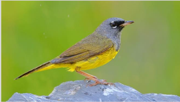
Figure 23 MacGillivray's Warbler