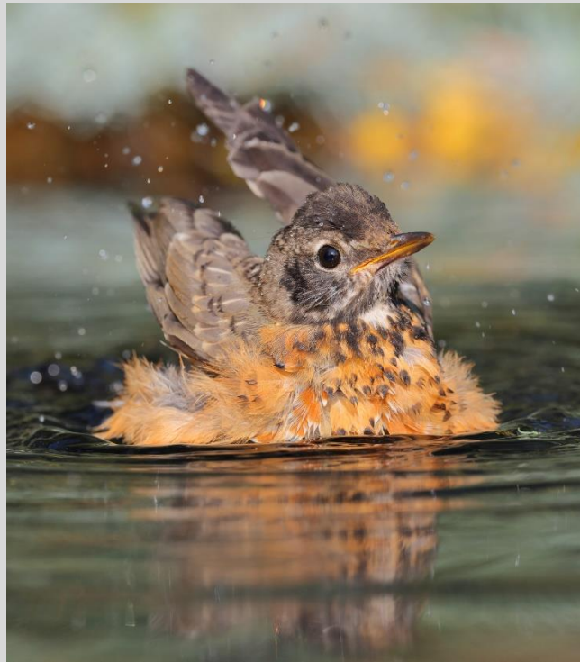
Figure 11 A juvenile American robin bathing in the pool during early September.

0799. We add a 3.5% service charge for using credit cards to cover the banking fees we must pay. So, save the credit card fees and send a check!