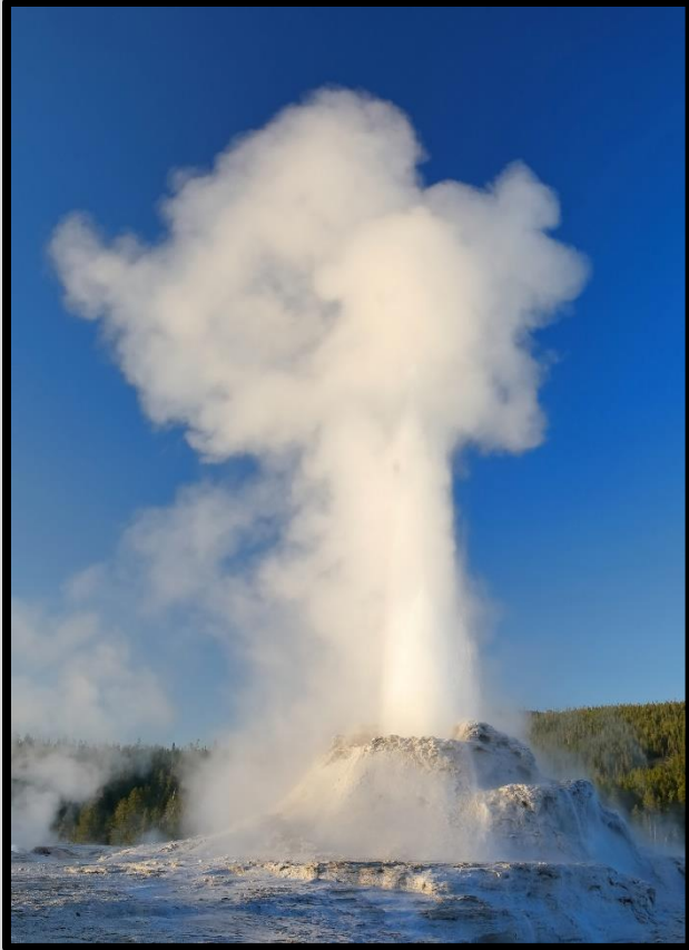
Figure 6 Castle geyser erupts twice a day. It is not easy to photograph due to the long 12-hour eruption intervals, but when it does, you get 45 minutes to photograph the action.