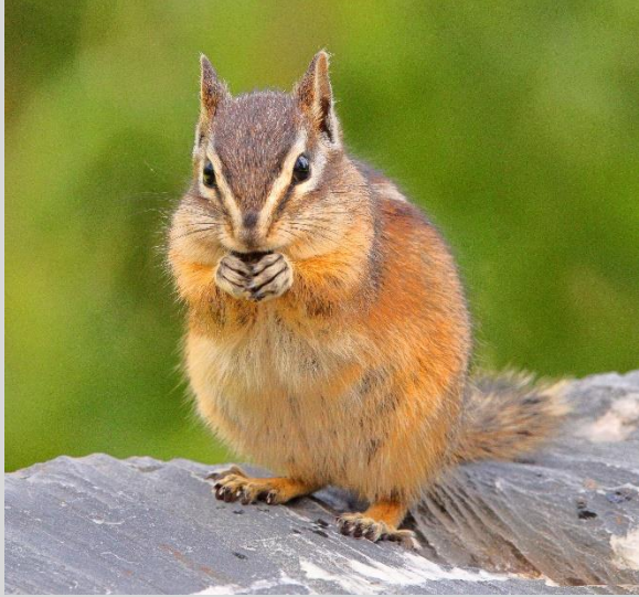
Figure 22 Yellow Pine Chipmunk