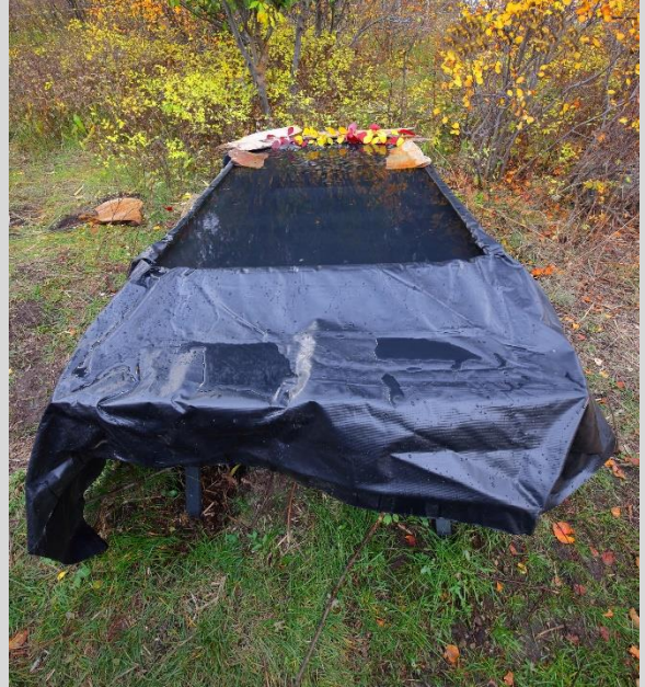
Figure 25 The reflection Pool