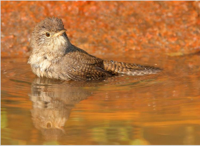
Figure 28 House Wren