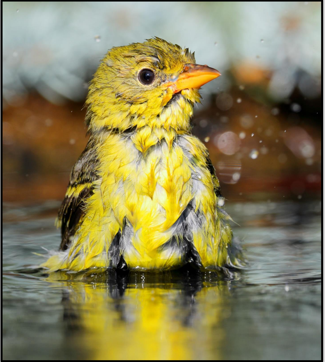
Figure 15 Western Tanager - during autumn the males lose their orange head feathers