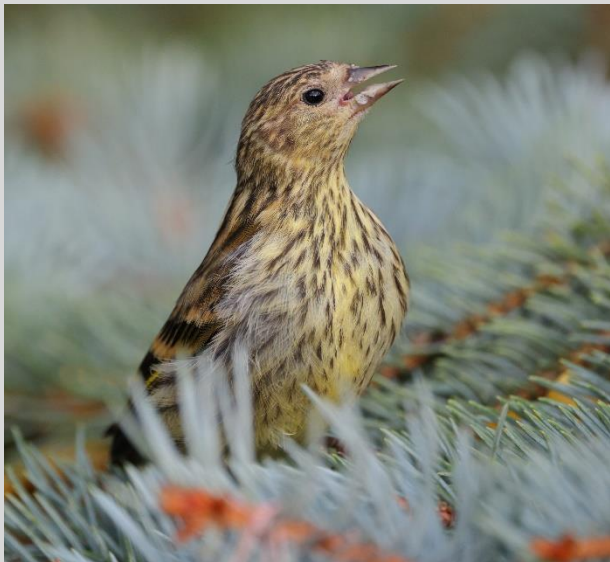
Figure 18 Pine Siskin