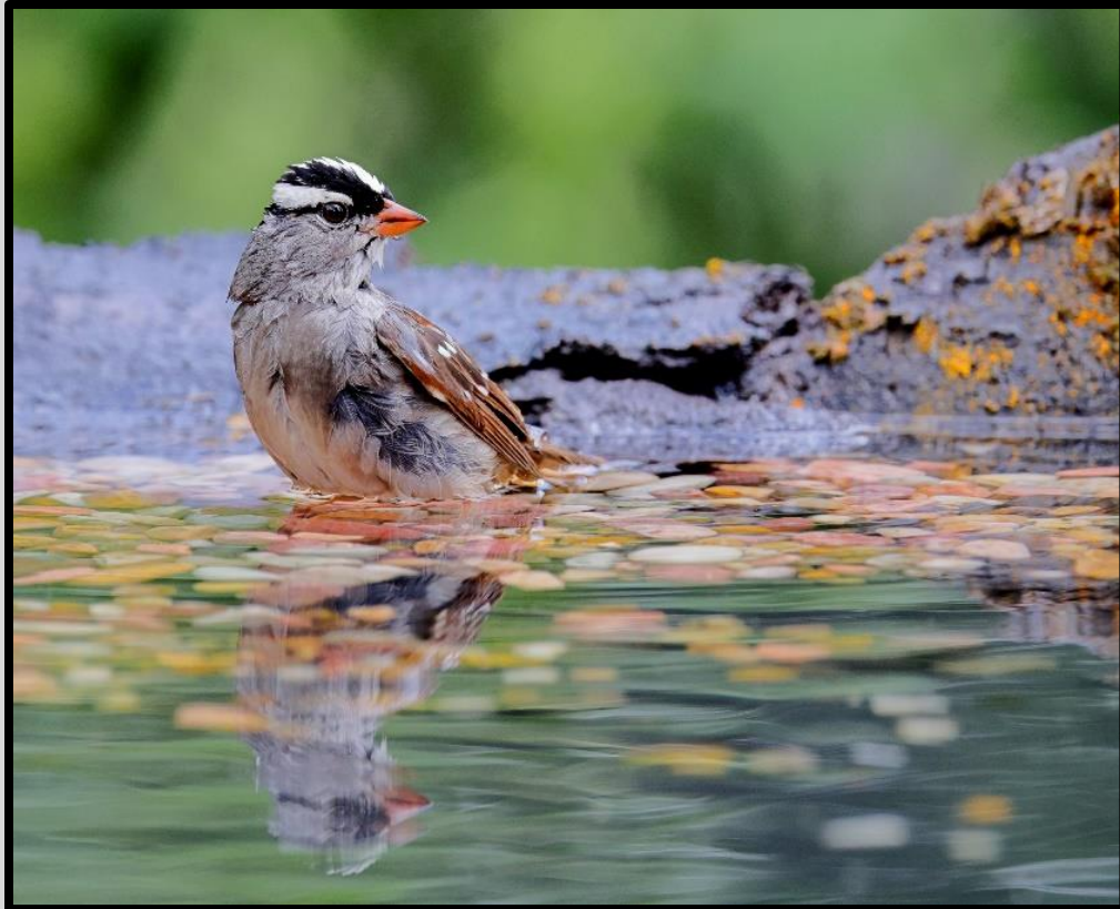
Figure 14 An adult, white-crowned sparrow at the reflection pool