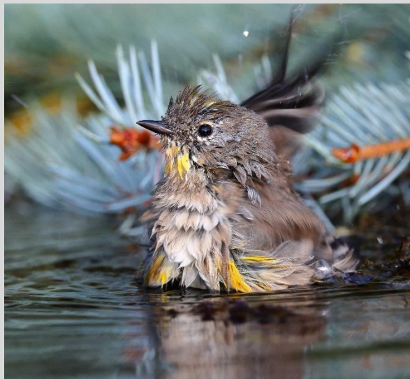
Figure 16 Audubon's Warbler