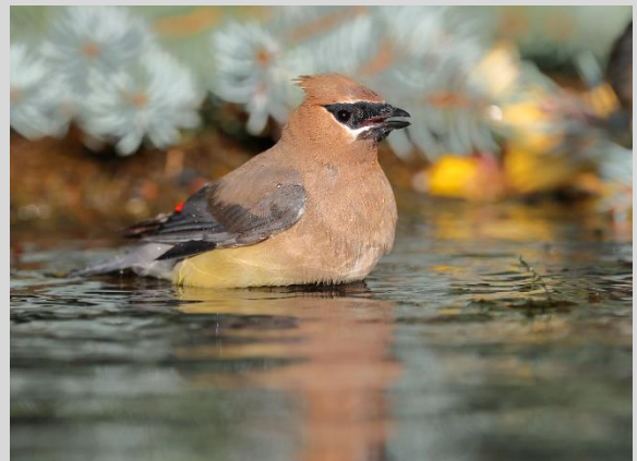
Figure 20 Cedar Waxwing