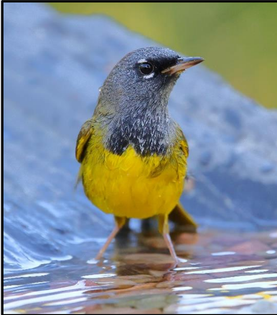
Figure 3 McGillivray's warbler hides in dense brush along creeks, but it readily visits water pools!

John and Dixie are avid photography instructors who readily share all their knowledge. While we teach the ultimate photo skills you must master to shoot superb images, they are not hard, and everyone can learn them. We will advance your photo skills considerably. This goal is especially easy to achieve because the group size is only 3 participants with two full-time instructors, allowing us to provide unlimited one on one instruction!!!!