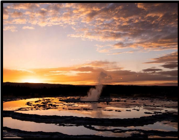
Figure 4 Sunset at Great Fountain Geyser

Participating in our nature photography workshop is the perfect way to tremendously improve your nature photography skills and learn about nature while enjoying the beautiful outdoors. We teach photography with great passion and enjoy it tremendously. Be amazed at how much you learn!