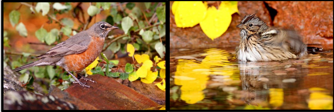
Figure 9 The American robin (left) and the Lincoln's sparrow both are attracted to our reflection pool setups.