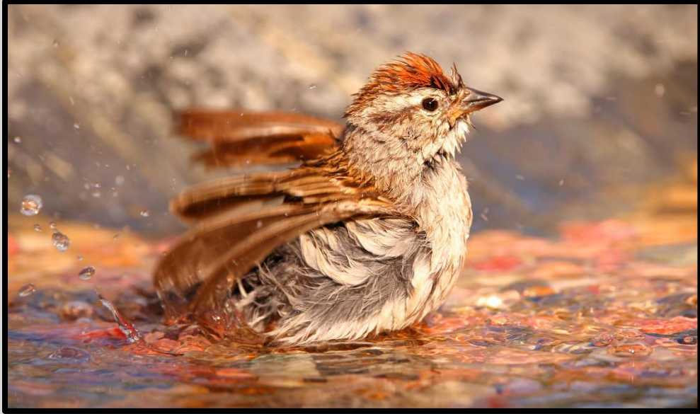
Figure 8 A chipping sparrow takes its bath in our yard drip. While this species is not interested in birdseed, it sure loves coming to water.