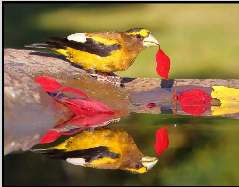
Figure 13 We added the red leaves to show autumn is coming and this male evening grosbeak decided to rearrange them. The Canon 100-500mm lens works perfectly for photographing wildlife at reflection pools as the subjects are only 8-12 feet away.