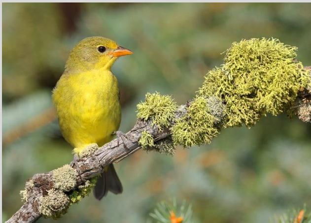
Figure 21 Western Tanager