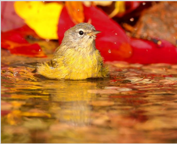
Figure 29 Orange-crowned warbler