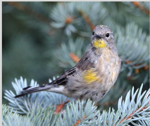
Figure 19 Audubon's Warbler