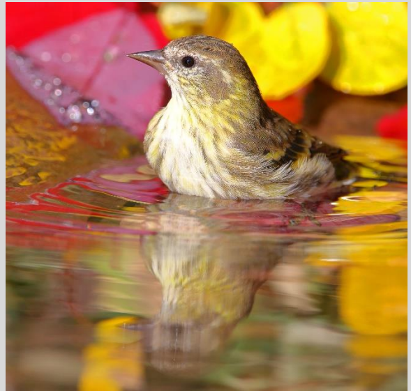
Figure 26 Pine Siskin