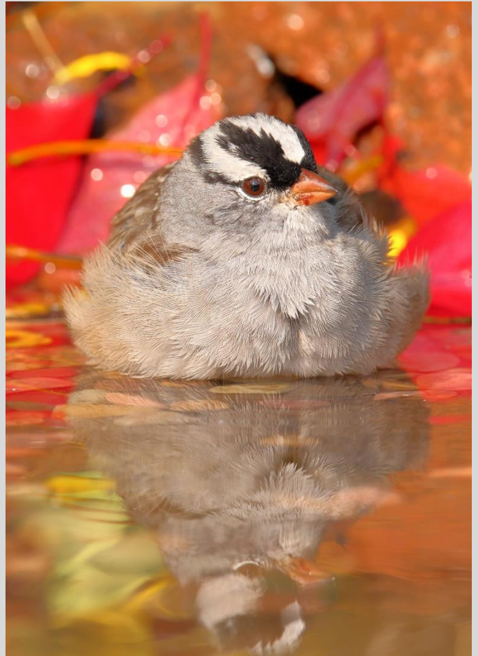
Figure 31 White-crowned sparrow