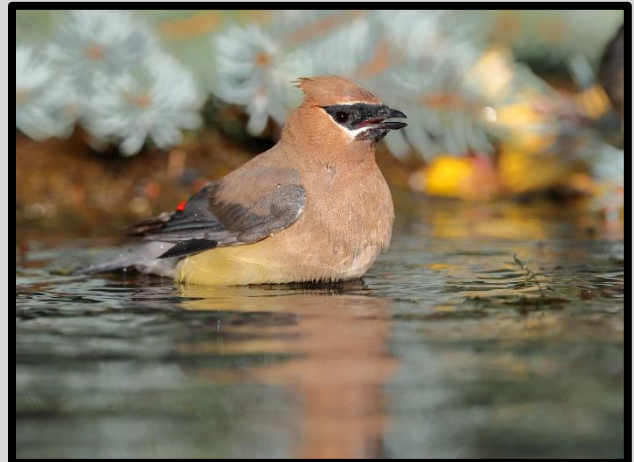
Figure 5 Cedar Waxwing