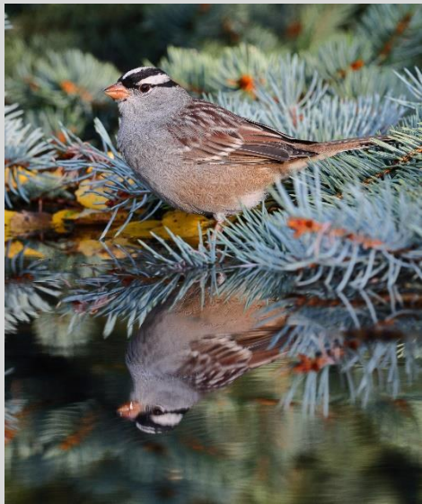
Figure 17 White-crowned sparrow