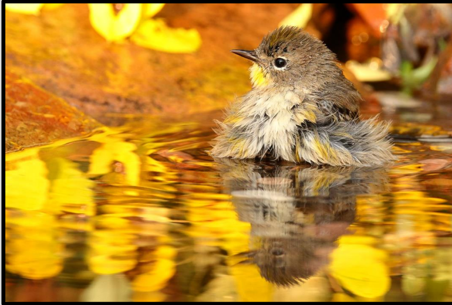
Figure 12 Expect to get plenty of chances photographing bathing birds like this Audubon's warbler, one of our more common visitors in early September.