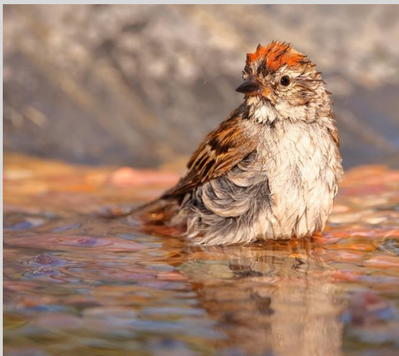
Figure 24 Chipping Sparrow